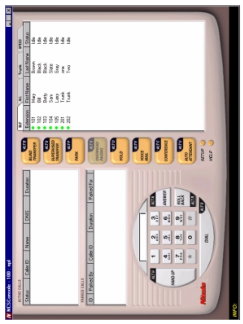
Figure 2. NCS Console main window

When you run NCS Console, you see the main window, an example of which is shown here.